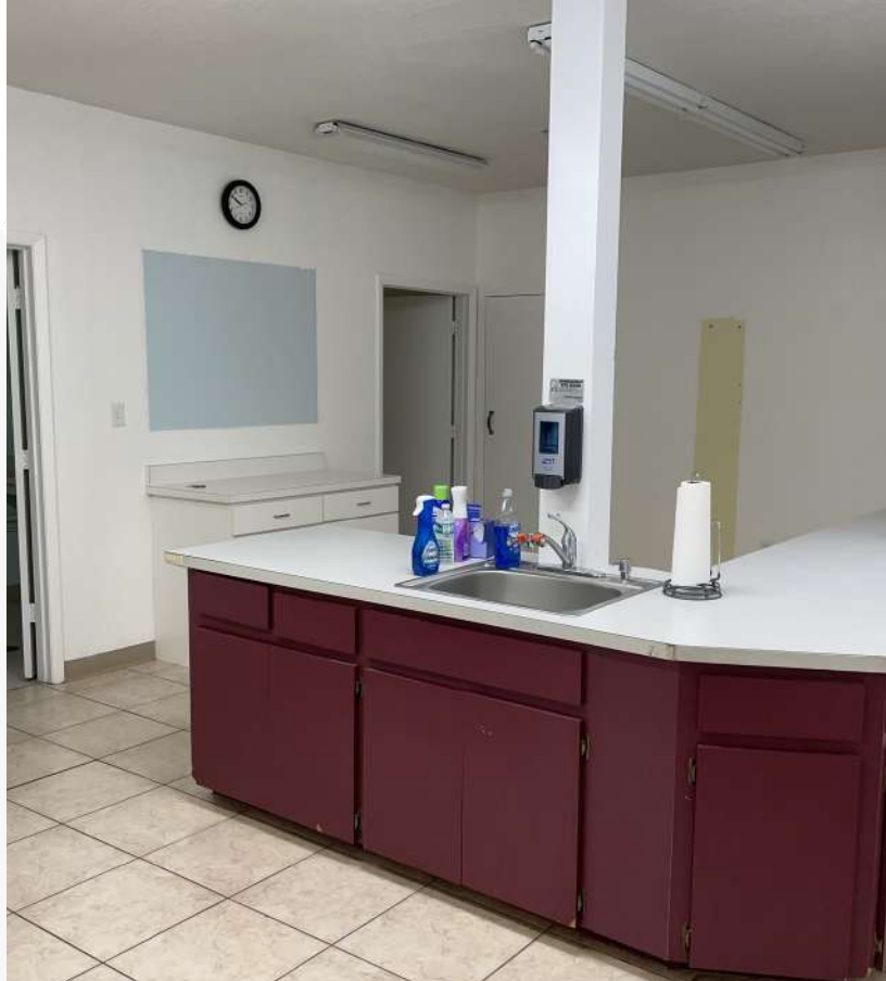
Central work area