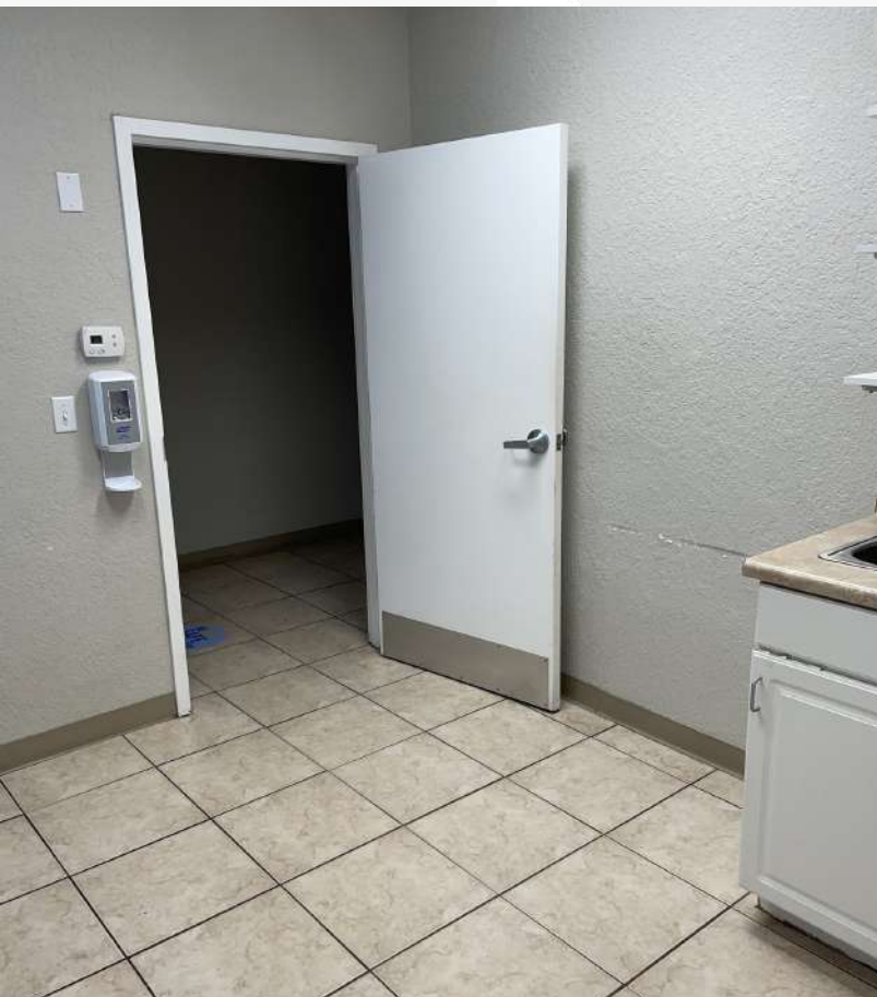
Typical exam room/office